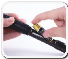
2. Insert a AA battery