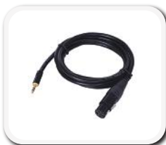
Cable with 3.5mm Plug