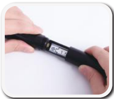
1. Unscrew the battery case