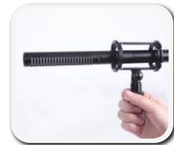
3. Push the mic through shock mount

4. Make sure do not block the slots on the side of the mic, as blocking will effect sound quality and polar pattern. And please remove the battery from mic when the mic isn't in use.