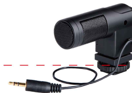
BY-V01 Mini Stereo Microphone